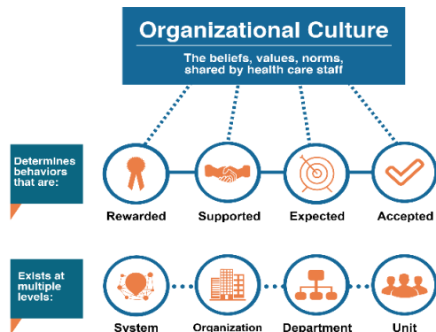
Figure 1. Description of Organizational Culture

Under the SOPS Program, AHRQ funds research on patient safety culture. With a contractor, AHRQ develops and maintains the SOPS surveys, toolkit materials, and databases; provides technical assistance and education; and promotes the use of the surveys for patient safety culture improvement.