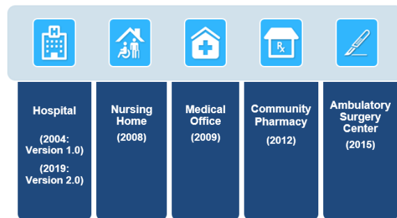
Figure 2. SOPS Surveys and Years Released